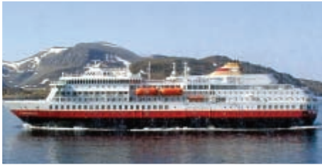
Finmarken of Havöysund

For more than a century, the world famous “Hurtigruten” has travelled along Norway’s scenic coast. Known as the “World’s Most Beautiful Voyage”, the Hurtigruten began in 1893 as an express shipping service between Trondheim and Hammerfest. The route has since been extended from Bergen to Kirkenes, and is now operated by two companies, OVDS and TFDS.